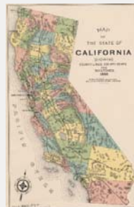
County Seats & Railroads, The Bancroft Library, UC Berkeley