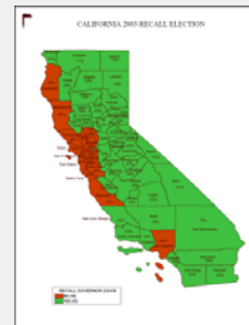
2003 Special Election Governor Gray Davis Statewide Database